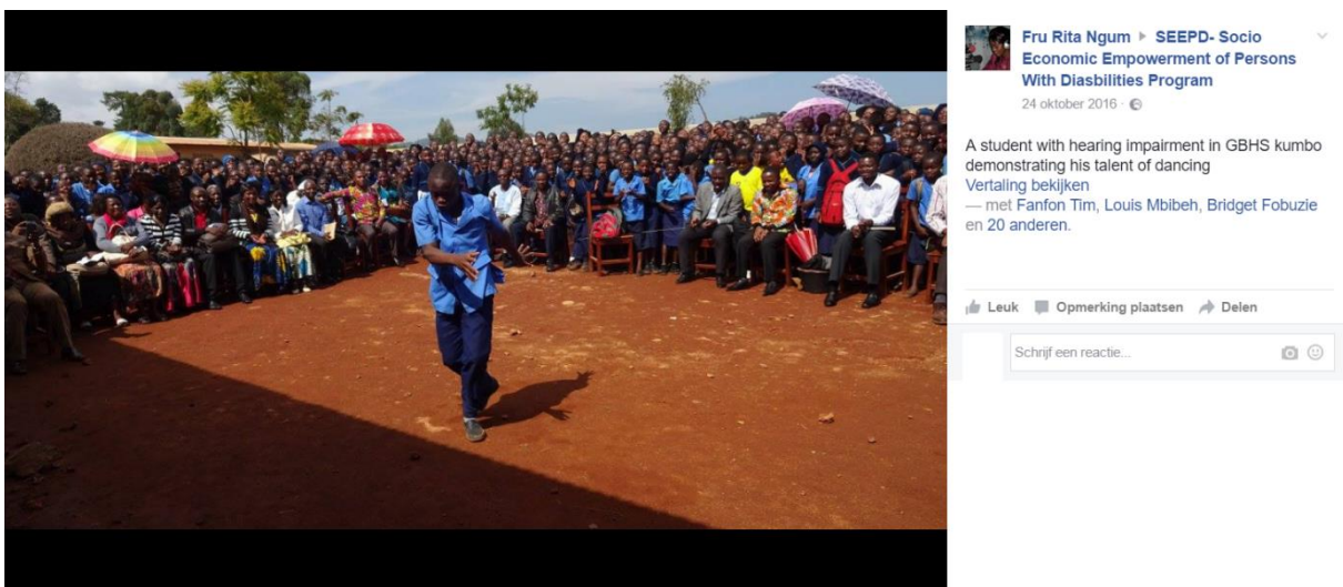
Photo 1 shows a more implicit example; where SEEPD communicated a message on their Facebook page which showed that children with a hearing impairment can also dance, and even have “talent of dancing” .

Besides giving examples themselves, they also let role models tell their own stories. This happens for instance through their radio show, but also during meetings where SEEPD invites role models to tell their story.